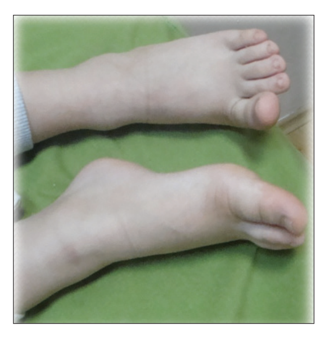
Figure 4. Deformities in the feet illustrate the impact on early childhood development, including muscle weakness and contractures.

structures and masticatory nuclei are present, bilateral paranasal sinuses are clear, and cranial bone structures are normal. WES revealed a primary finding of a phenotype-related variant, NPC1 :c.1421C>T / p.Pro474Leu Class 1, and a secondary finding of a variant related to another