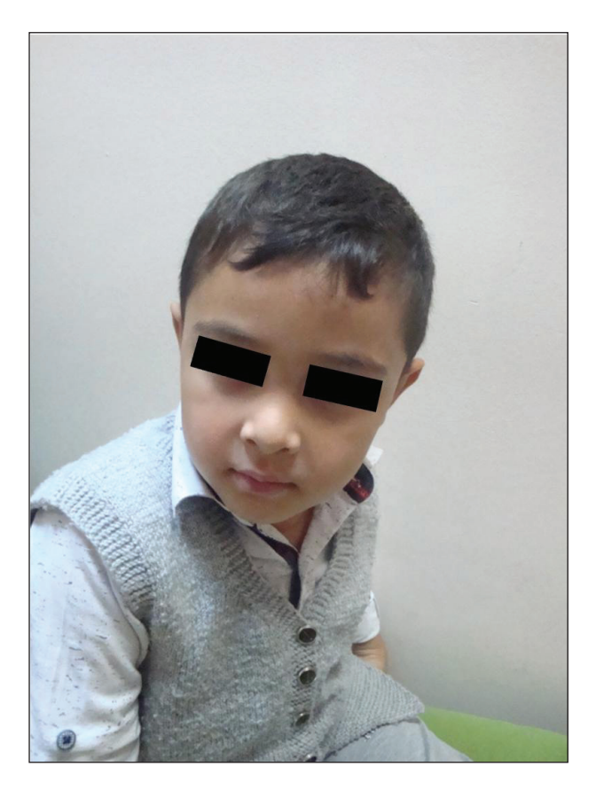
Figure 3. Anterior profile displaying subtle facial asymmetry.