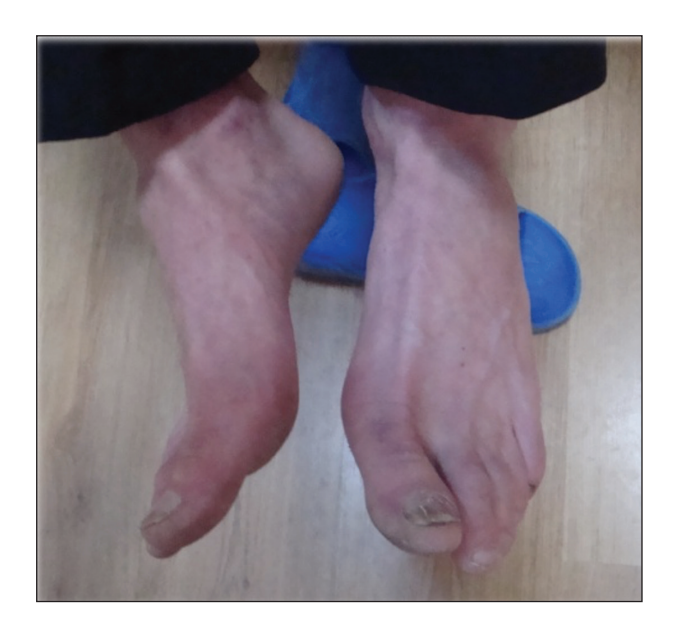
Figure 2. Deformities in the feet demonstrate significant muscle wasting and contractures, a consequence of progressive neurological impairment.

hemispheres and vermis, a minimal diffuse volume loss in both cerebellar hemispheres and the vermis, a slight signal increase in the white matter near the ventricles on T2A-FLAIR images, mild dilation of the ventricular system, and no periventricular demyelination-compatible signal change. The other myelin pathways appear normal, bilateral basal ganglia and thalami are normal, the corpus callosum is normal with no significant signal changes, major vascular structures are unremarkable, orbital